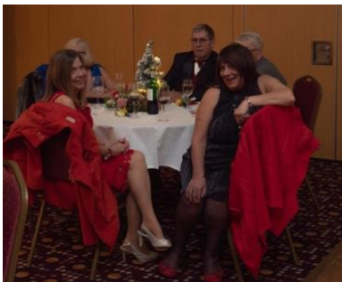
“All dressed up for the Dinner Dance”