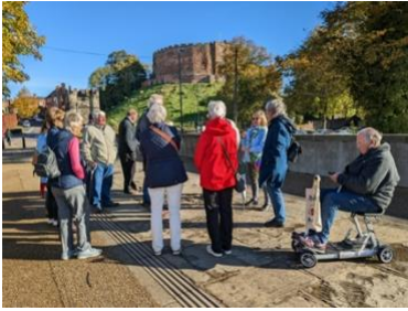
“Walk around Tamworth”