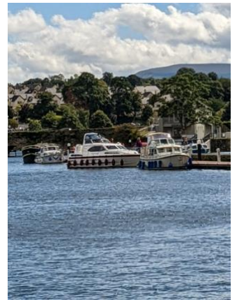
On Lough Derg approaching Killaloe