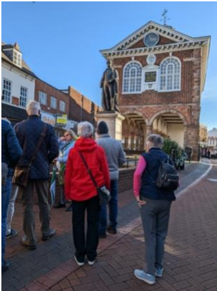
“Bantry Bay at sundown”