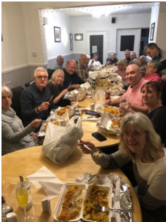
Fish & Chip Supper at the Uttoxeter Weekend