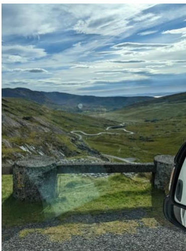
Crossing the Cork & Kerry Mountains